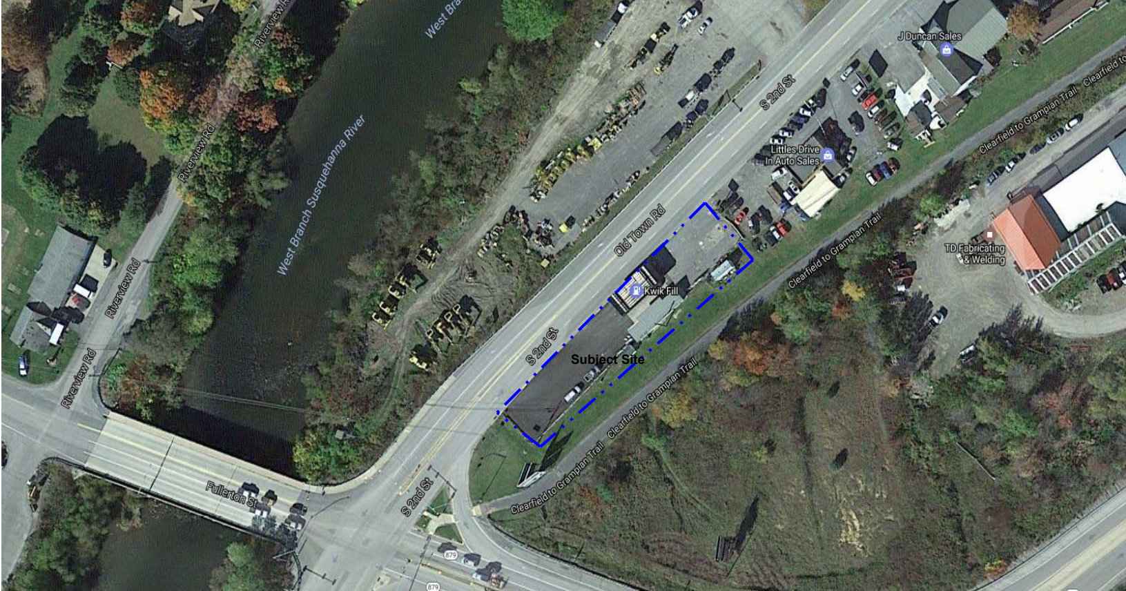
Figure 1 – Site Location Map